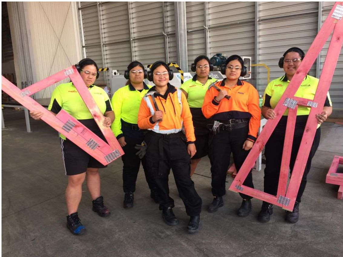
Diversity at work at Akarana Timber frame and truss factory.

The survey form for companies can be accessed here up to August 27.